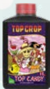
1 l bottle