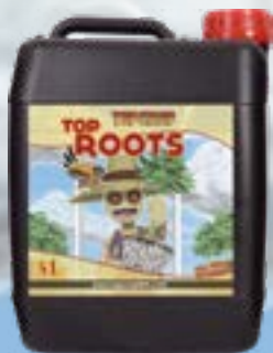
5 l container