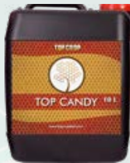
10 l container

TOP CANDY is a product based on natural plant extracts, rich in carbohydrates. Its main function is to increase the weight and volume of the flowers. Moreover, due to its composition, it significantly improves the smell and taste of the crops. TOP CANDY is 100% natural and organic so it can be used until the last day of the cycle.