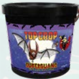
5 kg Bucket