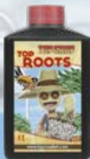
1 l bottle

ROOTS is a concentrated rooting supplement effectively developed to ensure optimal root production. Suitable for the preparation of nutritive solutions, in combination with SOIL A + B for its application in the soil.