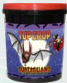
1 kg Bucket

SUPERGUANO and NITROGUANO SUPERGUANO are 100% natural bat guano, collected from the caves where bats live, far from human influence. Their feed consists of fruits and wild insects. Thanks to the absence of contamination in bats environment and their natural diet, SuperGuano and Nitroguano can boast of being an ecological and chemical free product.