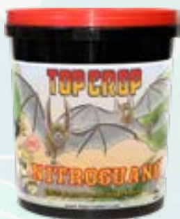
600 g Bucket