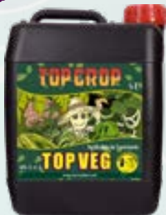
5 l container