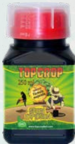
250 ml bottle

GREEN EXPLOSION promotes cell proliferation and provides a noticeable increase in the volume of the vegetable mass and root system, increasing the chlorophyll content to improve photosynthesis. This entails a considerable increase in the proportion of shoots (up to 30%) and therefore, of flowers. At the same time it's an excellent revitalizing and recovery from damage caused by pests and different stress factors (drought, extreme temperatures, etc ...).