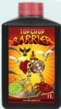
1 l bottle

BARRIER improves the absorption and transport of nutrients throughout the plant. It strengthens cell walls, making plants more resistant to fungal, insect and mite pests. It increases chlorophyll levels, encouraging photosynthesis and contributing to a better development of these, as well as the absorption of CO 2 from the environment.