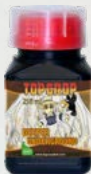
250 ml bottle

and its water-holding and fertilizer-holding capacity.