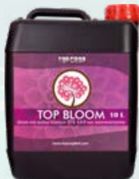
10 l container

TOP BLOOM is formulated with humic acids of high natural organic activity. Its high content of phosphorus and potassium stimulates the start of flowering and the development of large and compact flower clusters. Due to its rapid absorption the results are almost immediate.