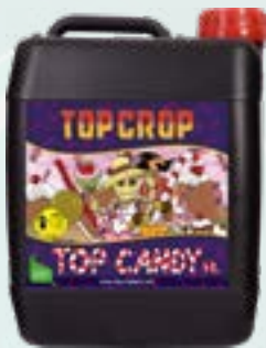
5 l container