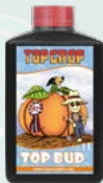
1 l bottle