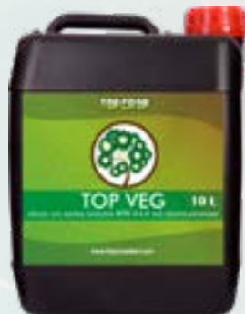
10 l container

TOP VEG is a complete liquid fertilizer rich in humic, fulvic acids and water soluble macro and micronutrients. It promotes growth, strengthens defenses against diseases and stress, regulates the pH balance of soil and increases the chlorophyll content, improving the photosynthetic efficiency of plants. It improves soil structure and its capacity to retain moisture and fertilizers.