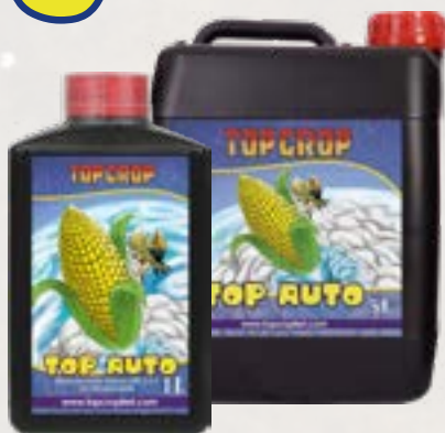
1 l bottle

TOP AUTO is a liquid NPK fertiliser with chelated micronutrients and humic and fulvic acids with high solubility. TOP AUTO is specially formulated for autoflowering plants. Thanks to its balanced content in nutrients and humic acids available immediately for crops, it acts as an excellent substrate conditioner. TOP AUTO stimulates the growth of the plant throughout its cycle and ensures the development of large and compact flower clusters.