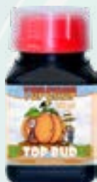
250 ml bottle