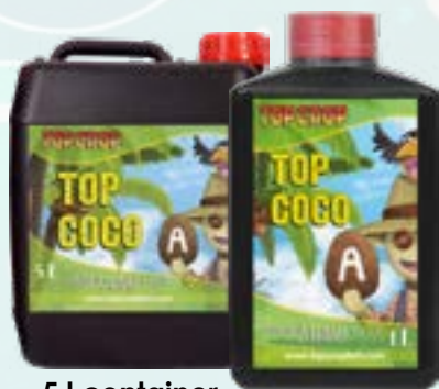
5 l container