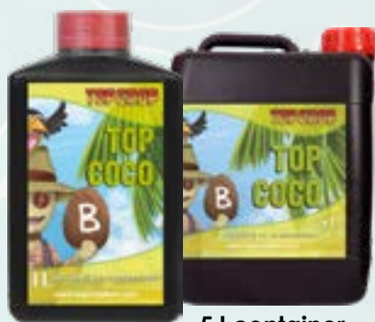
1 l bottle