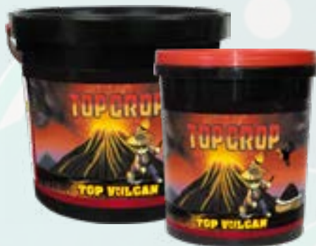
4 kg Bucket 700 g Bucket

This mineral fertilizer is finely ground and volcanic rock powder of the island of Java. The lava powder is rich in trace elements that are essential for all plants. This powder allows plants to deal with the hardest climatic periods and strengthens their defenses against certain diseases by increasing the resistance of cell tissues. It provides a better use of the macronutrients that have been brought under cultivation. Improves soil structure and lowers the pH due to its slightly acidic condition. Due to its origin and the absence of chemical treatments it's ideal for 100% organic crops.