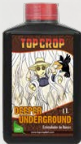
1 l bottle