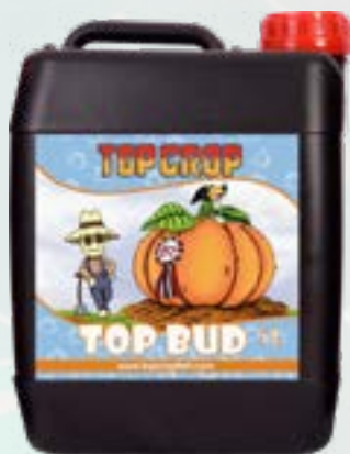
5 l container

TOP BUD is a fattening fertilizer for the flowering stage. Its maximum concentration of phosphorus and potassium and its absence of nitrates make it an ideal fertilizer for fattening, while respecting the good taste of the crop. It is also rich in amino acids that benefit the development of flowers. If you want a finish that guarantees excellence in your crops TOP BUD is the winning bet.