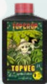
1 l bottle