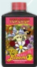
1 l bottle