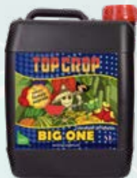
5 l container

BIG ONE is a bloom stimulator formulated with seaweed extract of the genus Ascophyllum Nodosum . Natural source of cytokinins and other growth regulators with high biological activity. Thanks to its high concentration (23% of algae), BIG ONE is incredibly effective increasing the volume of flowers up to 40% and increasing the production of resins and essential oils by more than 30%.