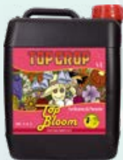
5 l container