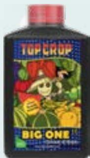
1 l bottle