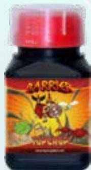
250 ml bottle